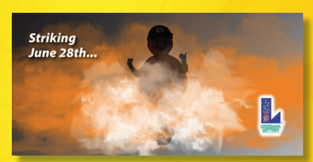
Outdoor Teaser Campaign